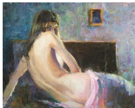
PEERING, OIL ON BOARD, 11 X 14"