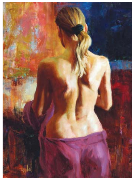
VIOLET WRAP, OIL ON LINEN, 24 X 18"