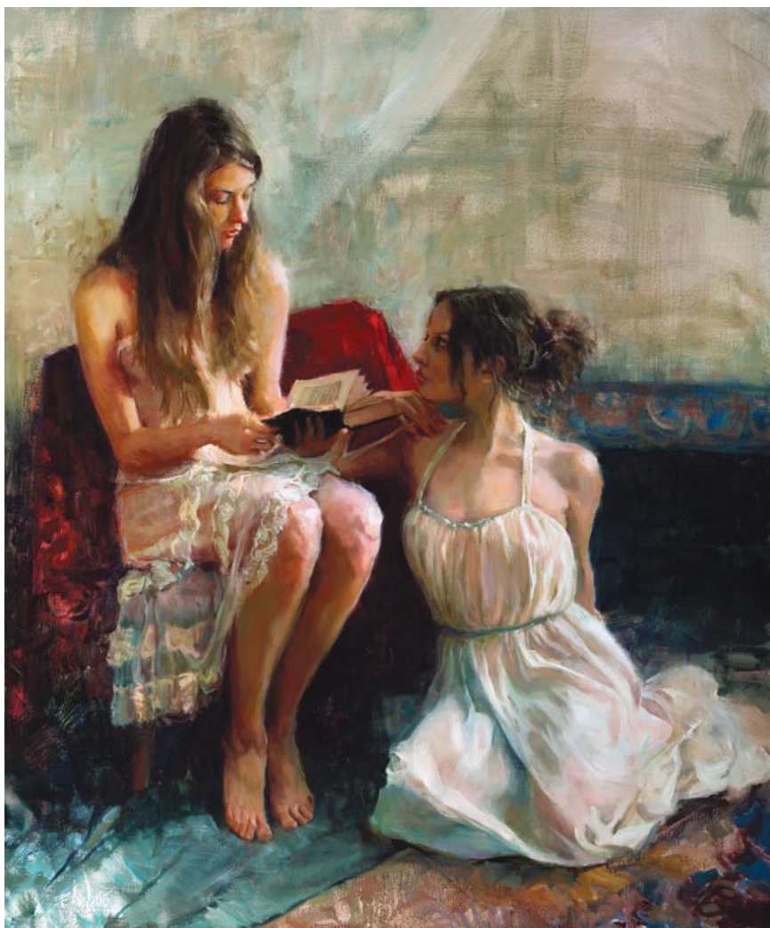
A GOOD READ, OIL ON LINEN, 36 X 30"